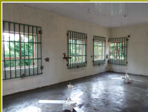
The meeting hall will be used for education and training

There was much talk from groups such as the