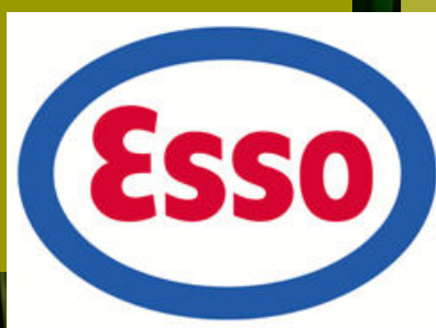
Esso Exploration & Production Nigeria Ltd. provided the main grant to build the centre

CCDC (Community Conservation and Development Committee) on using the Centre as a base for NGO's working within the community, and also as a base to collaborate with neighbouring Community Based Organisations on projects of common interest. Additionally discussions centred on the opportunity to raise funds for maintenance of the centre by hiring out the hall for social functions, and the accommodation to tourists.