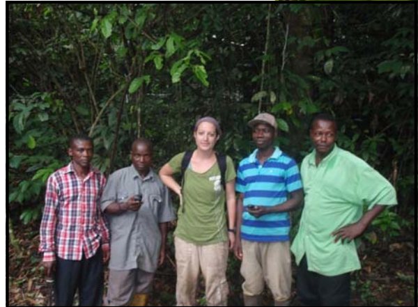
The Surveillance Team honing their GPS skills

Knowledge on data entry was also provided. They seemed to enjoy the Photoshop lecture the most, learning how to import, re-size, label, and store the phenology pictures. Sagan, our visiting Red-Capped