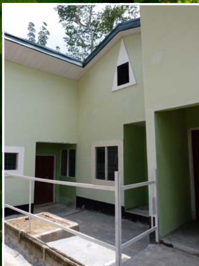
Front and side view of the Community Centre as it receives the finishing touches to the building stage